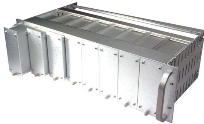
Assembled Module Subracks (CMA)