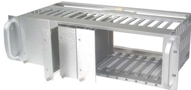
Assembled Card Mount Subracks (CCM)