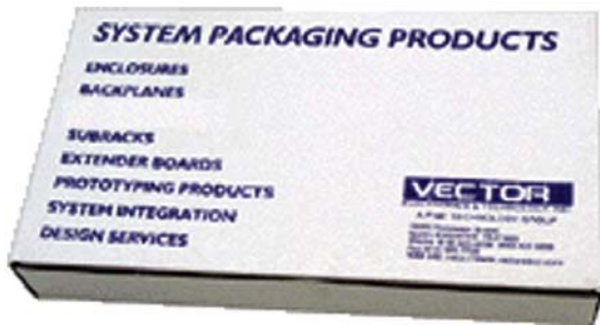
Subrack Kits (CCK)

New Item: CCK19F/90 (For max 11.5" x 13.5" cards)